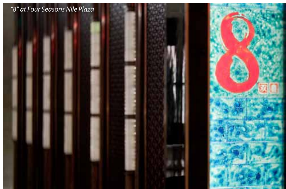
"8" at Four Seasons Nile Plaza

The Asian fast-food genre has also taken on the trend, opening branches in the capital and the main regions, with Panda House Express. And, like in every city where there is an Asian community, restaurants specifically for migrants have opened up. Most are located in the Maadi area, home to the expatriate Asian community. One of the most popular is China Winds, where customers can experience typical Chinese dishes that haven't undergone 'Westernization', such as pickled chicken feet, lily bulb soup or braised camels' hooves. There is another one near Al-Azhar mosque: the Uyghurs where the second largest population of Chinese Muslims live in Cairo. For years, young religious Uyghur students have come to study at the Islamic university. And the place is probably one of the most typical of the capital city, as the outside sign is in Chinese and the menu does not offer an Arabic translation. For local clients, the owner has created photo albums with the pictures of the dishes, so they can point at what they want to order. Now that the trend of Asian cuisine is well settled in Egypt and the region, the new challenge is to give menus a more distinctive touch, by differentiating Thai from sushi, dim sum from curry. All these traditional recipes are still mixed in the minds of local customers, who broadly refer to them as 'Asian', when in Western markets their specificities have already been recognized for a while.