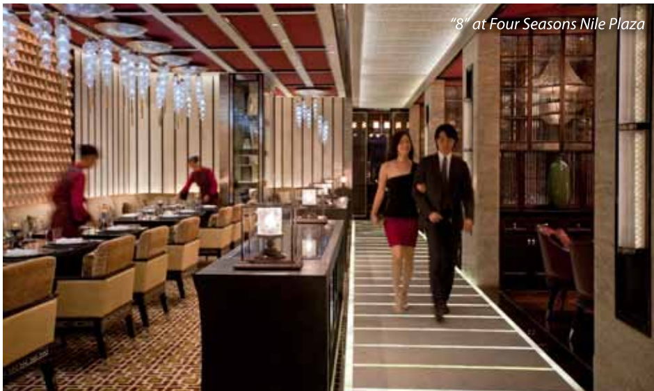
"8" at Four Seasons Nile Plaza

Western markets. The current fashion of 'minimalism' in restaurants explains the success of sushi places, which spread massively in the GCC. This trend encouraged the development of a signature interior design, with a sushi trail. Yabani in Beirut is also known for its original and daring setting. This craze for sushi places tends to overshadow other types of Asian restaurants, which are seen as more typical when not outdated. Some specific dishes such as the Chinese steam cooked dim sum or the noodles have their aficionados though, and help trigger the revival of other Asian recipes. Some dishes even remind customers of Middle Eastern mezzes, with the food served in cups along with plates and saucers to encourage sharing. The Thai Kitchen in Dubai's Park Hyatt Hotel is one of the examples, with its three open kitchens around which you can sit. Dubai and Beirut are currently the cities with the widest choice of Asian restaurants. This development was supported by the large Asian expatriate communities in Dubai, who provided skilled staff.